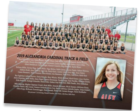
8x10 Memory Mate